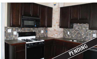
702 PROSPECT STREET, EAST JORDAN Beautifully updated 4BR, 2BA two story brick home on a quiet street near downtown. 3-Season covered porch. MLS 438318. Ask for Mike Stark. $94,900