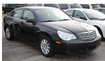
2007 CHRYSLER SEBRING LX Air, cruise. SALE PRICE $6,995