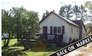
405 UNION STREET, EAST JORDAN What an amazing backyard, a fire pit with hand carved logs to sit on for entertaining, great landscaping and a deck too. MLS 438606. Ask for Holly Nierman. $74,900