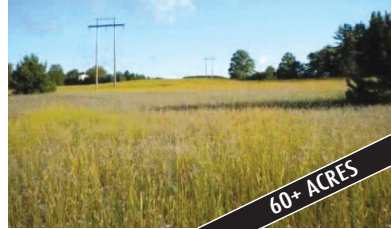
TBD MILES ROAD, EAST JORDAN 60+ acres of prime hunting property with road frontage on Miles and Nelson Rds. Ranney Creek flows through the property. MLS 436383. Ask for Jennifer Burr. $155,000