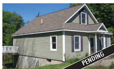
01865 LAKE 26 ROAD, CHARLEVOIX Home is in overall good condition with new paint throughout, new carpet in lower level, quiet country setting on county maintained road. MLS 437138. Ask for Mike Stark. $99,900