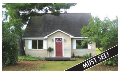
320 OLD STATE ROAD, BOYNE CITY Close to town but still far enough out of the way and off the main road. Many updates to home including a new 6" well in June 2013. MLS 438008. Ask for Mike Stark. $114,990