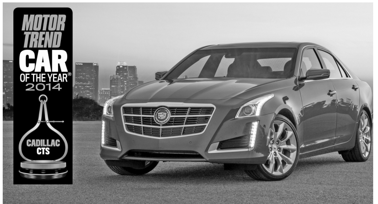
Motor Trend recently announced that the 2014 Cadillac CTS sedan is its Car of the Year for 2014. The third-generation CTS sedan is based on the high-performing rear-drive architecture of the award-winning ATS sport sedan, moving Cadillac into the prestigious class of midsize luxury sedans.