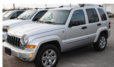
2006 JEEP LIBERTY LIMITED 4x4, trail rated, loaded. AS LOW AS $199 A MONTH.