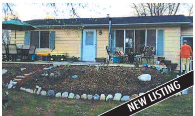
4183 CINDER HILL ROAD • ALBIA Newly remodeled 2 BR home on a double lot with an attached garage. A great getaway spot close to skiing & snowmobiling. MLS 438758. Ask for Holly Nierman. $46,000