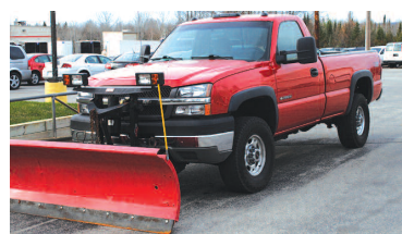
2003 CHEVY SILVERADO 2500 HD With Western Snow Plow. 4WD, Z-71 pkg, bedliner, tow pkg. SALE PRICE $11,995