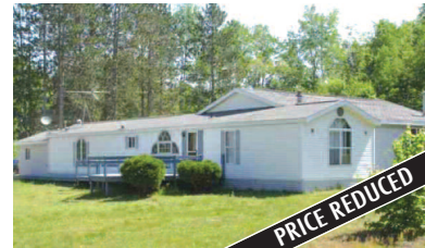
06834 FAIR ROAD, EAST JORDAN Well maintained mobile with two large additions. Includes 30 x 30 detached garage and a 30 x 30 pole building on 13+ acres! MLS 434955. Ask for Jennifer Burr. $63,000