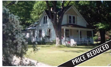
8389 W STATE STREET, CENTRAL LAKE This Charming in town home sits on almost 3 acres with a beautiful creek out back. 5 Bedrooms with 1st floor laundry. MLS 437648. Ask for Holly Nierman. $99,000