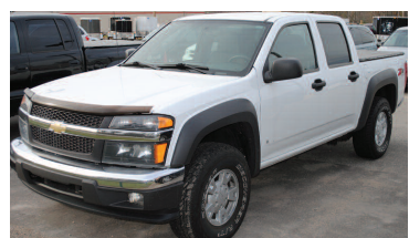
2006 CHEVY COLORADO LT3 4x4, Z-71 pkg, soft tonneau cover, bedliner, tow pkg, 4 door. AS LOW AS $199 A MONTH