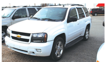
2008 CHEVY TRAILBLAZER LT 4WD, loaded. Only 75K. AS LOW AS $199 A MONTH