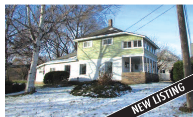
1009 WATER, EAST JORDAN Nice home on the edge of East Jordan. Two car detached garage, Paved drive. Large lot with lots of room for the kids to play. MLS 438945. Ask for Chris Oliver. $79,900